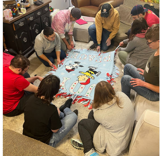
Matthias Students Making Blankets

and there's no better way to cultivate that sense of purpose than by helping others. Furthermore, Matthias students actively utilize and develop a wide range of life skills, including comprehension, fundraising, decision-making, planning, mathematical skills, social skills, fine/gross motor skills and organizational skills. While Matthias Students Give Back provides support to the community, the students simultaneously experience the profound reward of helping others while enhancing their own abilities.