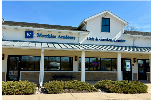
Matthias Gift and Garden Center