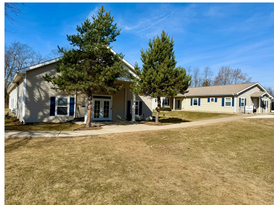
Academy Campus - Hwy 83