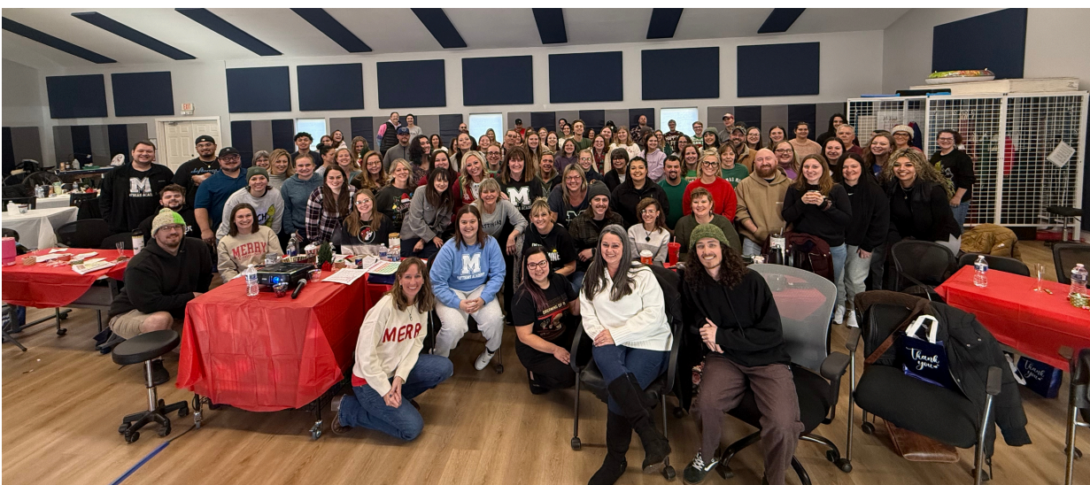
2024 Christmas Matthias Academy Staff Photo

A significant step in the Academy's growth is the 8,100 sq ft expansion of the 83 Campus. While awaiting certification, targeted for late summer 2026, this expansion is expected to accommodate an additional 40-50 students from the extensive waitlist. Although initial plans for a 200,000 sq ft dream Academy on the 83 Campus are no longer feasible due to water and WisDOT restrictions, the five-year plan remains focused on identifying a third campus or additions to an existing campus.