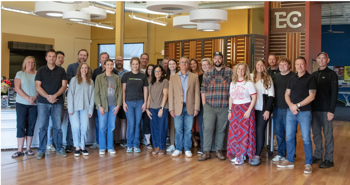
Equity Creative Team