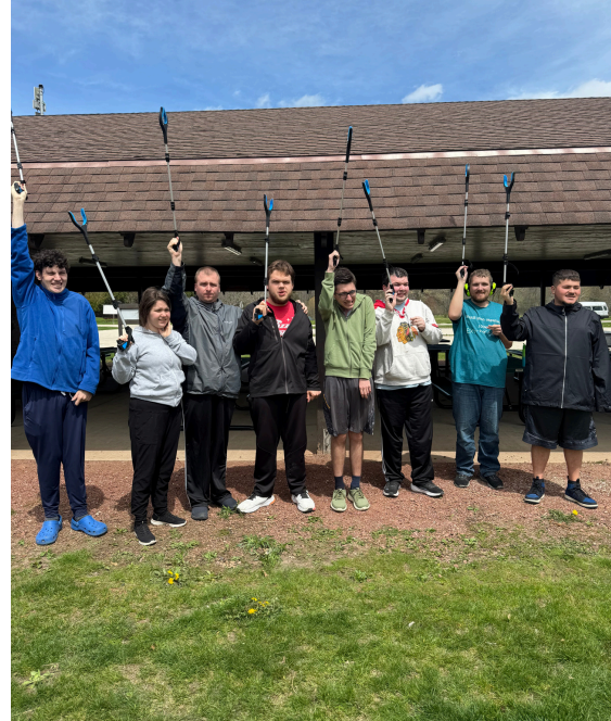
Matthias Students Cleaning Area Park