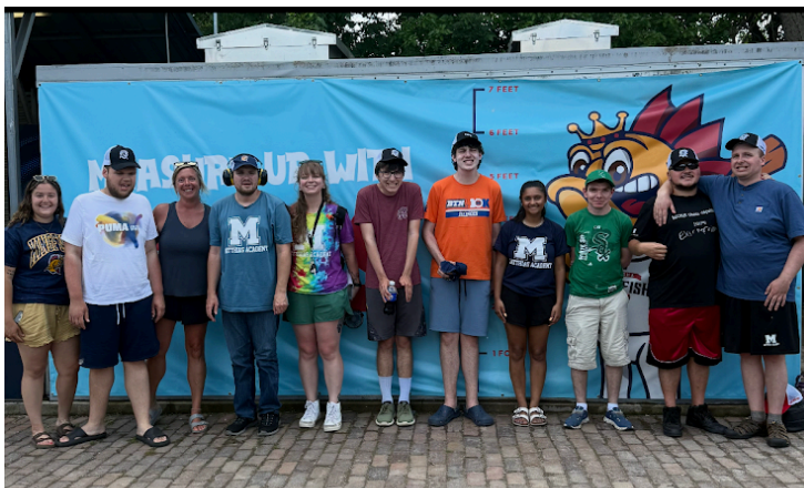
Matthias Tau Fraternity