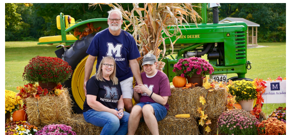
Image from Fall Fest & Concert 2025

Finally, the PPOC is now focusing on helping new and existing families with onboarding and understanding