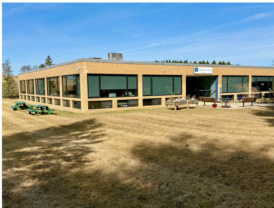
Academy Campus - Abbey

To support Matthias Living, the acquisition and construction of four-bedroom homes in Wisconsin, estimated at over $500,000, are entirely dependent on donations, as the State provides no financial assistance for the home, vehicle, or furnishings. All residential donations go into the residential restricted fund specifically for purchasing and building Matthias Living Adult Family Homes. Families interested in making monetary donations are encouraged to do so, as all contributions are greatly appreciated.