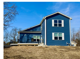
Atlas, Athena, Apollo and Artemis homes