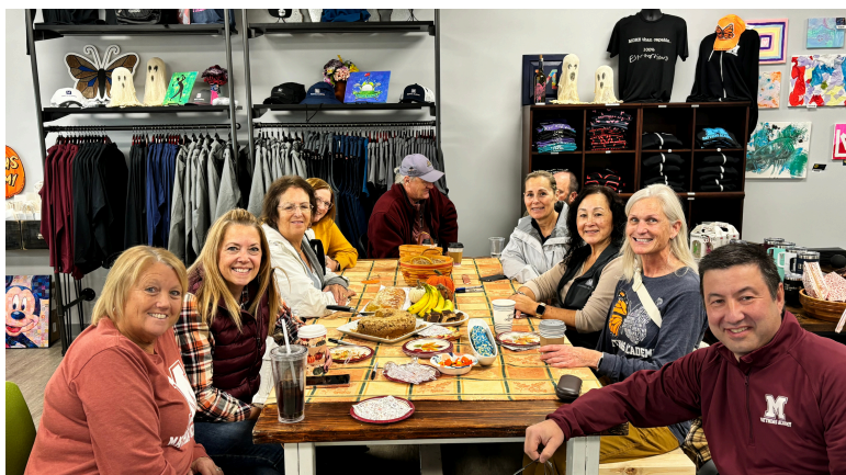
Volunteers at the Gift Shop