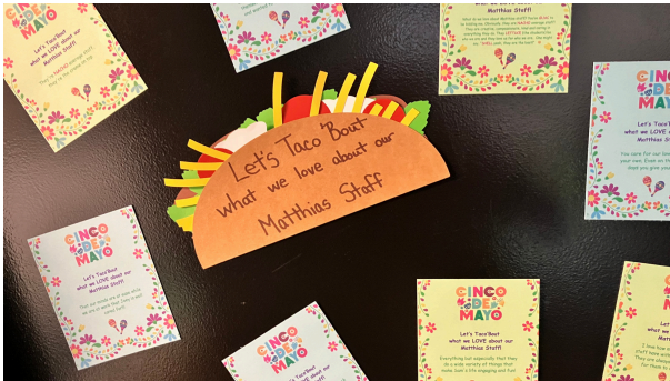
Staff Appreciation Notes of Gratitude

Frequently Asked Questions. They have already rolled out FAQs for new families and are in the process of publishing them for existing families, while also identifying opportunities to help guardians and friends connect. This initiative aims to deepen connections within the Matthias community and ensure all families feel informed and supported.