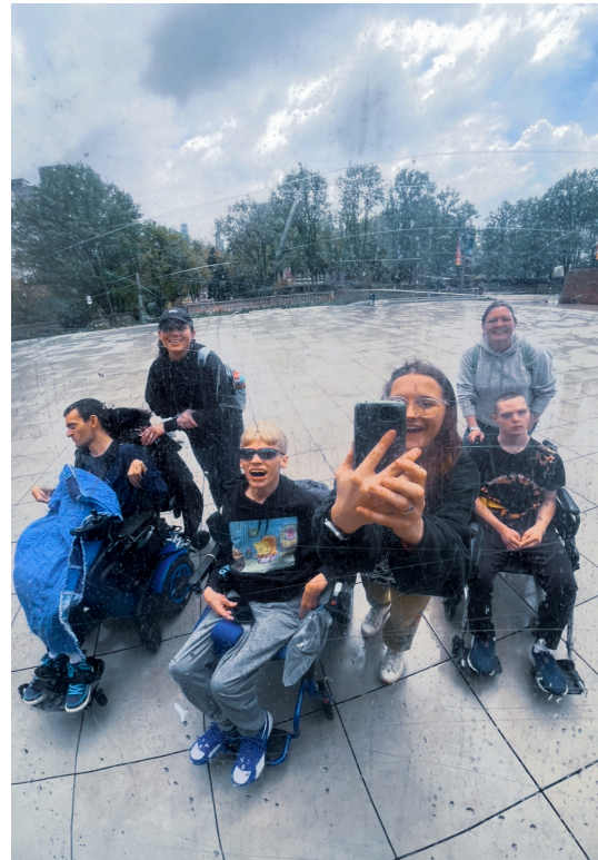
Sigma Frat at The Bean in Chicago