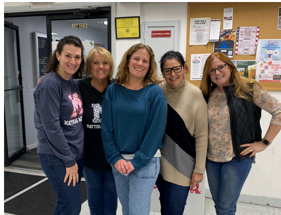
Portion of CONNECT at BUNCO 2025

While fundraising is not the primary goal, donations have helped keep events free or inexpensive. To date, these community efforts have reached over 300 people and relied on volunteers from Matthias families, staff, and students from local schools, truly making it a community effort.