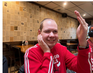
Pi Nu Looking Ahead