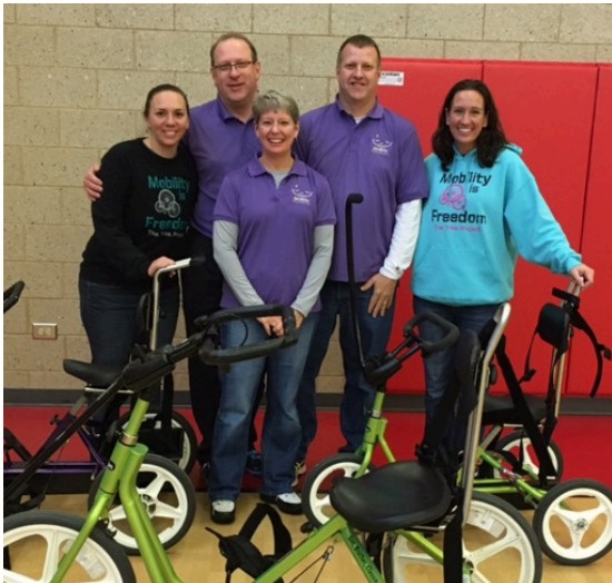
the WERTHy Foundation Trike Donation

the WERTHy Foundation has donated over $250,000 since 2013, with donations primarily being cash for specific equipment or programs. The foundation hosts two annual golf outings, a larger one in May and a smaller one in November, which are key to their fundraising efforts. Unlike larger foundations, the WERTHy Foundation does not have paid staff.