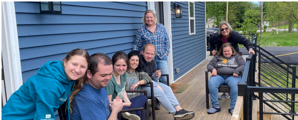
Apollo and Artemis Residents and Staff