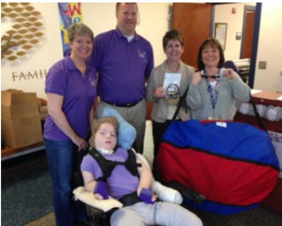
thE WERTHy Foundation Laremont Donation

Also, fundraising events like the annual Golf Outing and the Gala always amaze us as to the number of people who participate and the amount of funds and resources that people are willing to donate. This shows how the acceptance and appreciation of Matthias goes way beyond the parents and families of the students, which is crucial for the program to thrive.