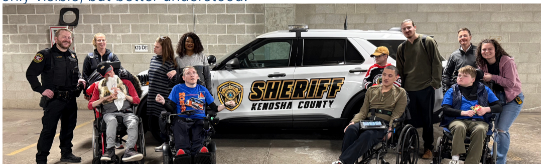
Members of Kappa Squad visiting Officers