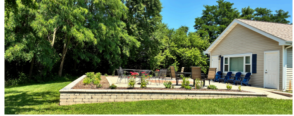
Matthias 83 Campus patio and Butterfly Garden