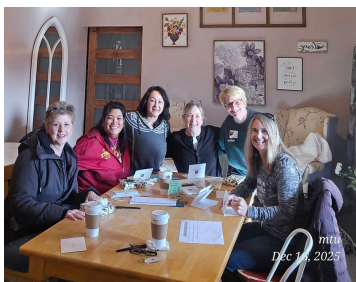
Thank You Note Writing