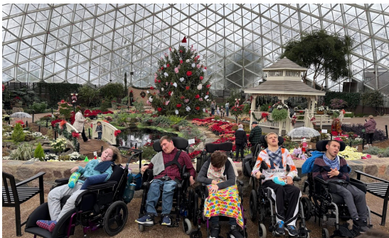
Members of the Kappa Squad at the Mitchell Park Domes