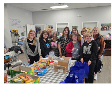
Open House and Service Project