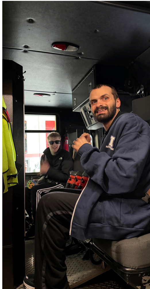
Matthias students checking out a fire truck

Contact projectvictory@matthiasacademy.org for any questions about Project Victor-Y.