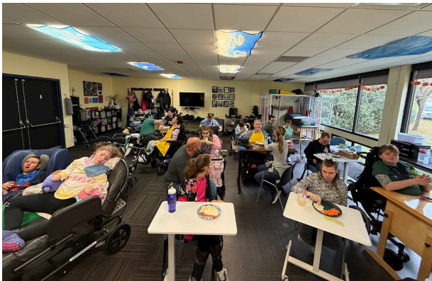
Members of the Kappa Squad enjoying snacks and a show

Key benefits to Squads include students having more choices, more friends, gaining time with different staff at their own pace and ensuring they all receive weekly priority at being first to choose an activity. The goal is also that each student goes on at least one outing per week and has a movement experience. All Matthias Academy students are scheduled to transition into Squads by the end of April 2026.