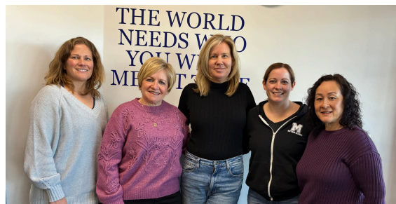
Matthias Outreach Committee

The Outreach Committee was established in March 2024 as the second committee at Matthias. Its primary focus is identifying, evaluating and establishing overall plans and