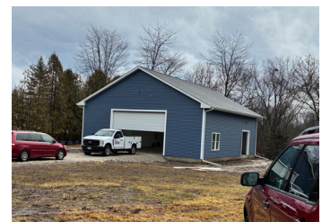
New garage at 83 Campus