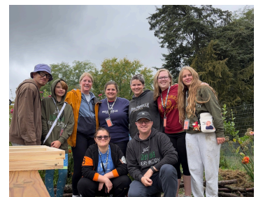
First United Methodist Volunteers