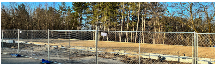
Foundation of 83 Campus expansion

The staff's dedication gives us the confidence that 2026 will be our best year yet!